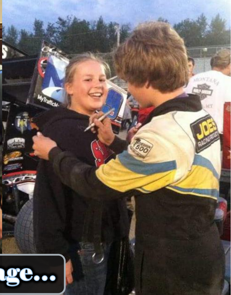
Focused at an early age...